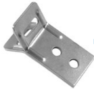
DE096 / DE097